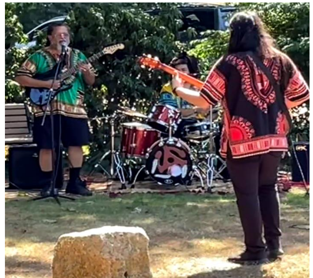
Three bands played in the back garden, and many other locations on Old Main Rd.

Thanks to all at our church who stepped forward and helped out at this community event! Help that included, but not limited to, those who organized, set up and broke down the tents; cooked and handed out the much-in-demand hot dogs, chips and drinks. Finally, thanks to those who stayed for all or part of the three hour festival and cleaned up after this hugely successful event for all of North Falmouth.