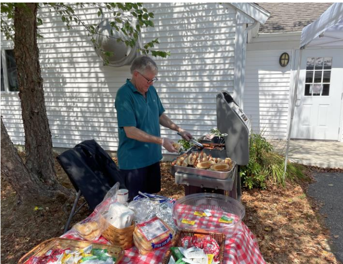
While volunteers gave out chips & lemonade.