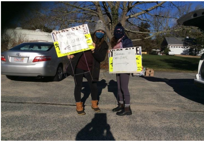
Belonging to Each Other donations on December 6 th helped supply much needed items for those experiencing homelessness in Falmouth.