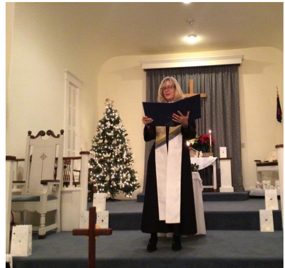
O Holy Night