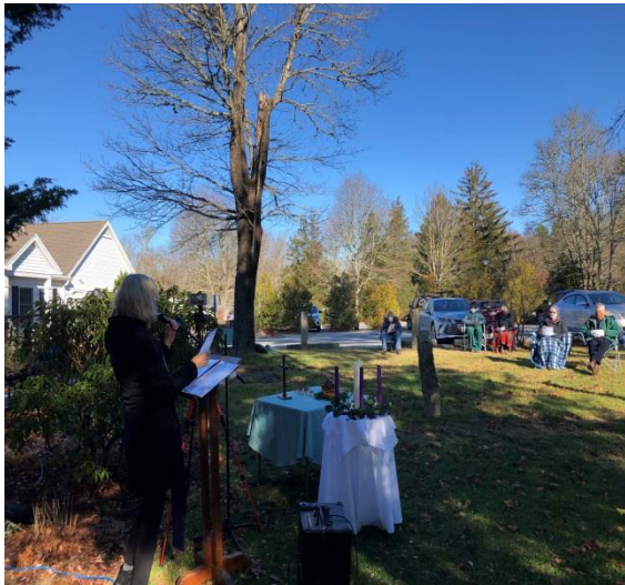
We were fortunate to have several nice, but a bit chilly Sundays in which to hold outdoor worship.