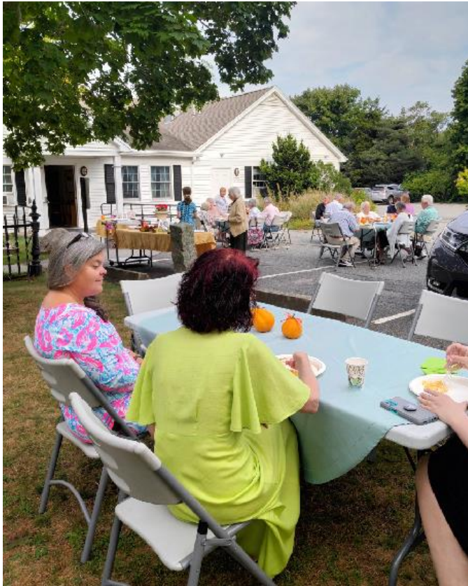
Sunday, September 11 8:30 a.m. a “Welcome Back” scrambled eggs & pancake breakfast before the 10 o’clock service.