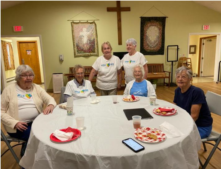
Our Beautiful Ladies, wearing the new church t-shirts at Homecoming Sunday, Sept. 8 th .