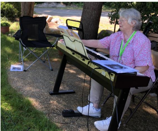
Our first Sunday with live singing from a soloist.