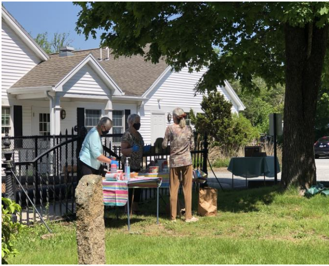
Ice Cream after the service.