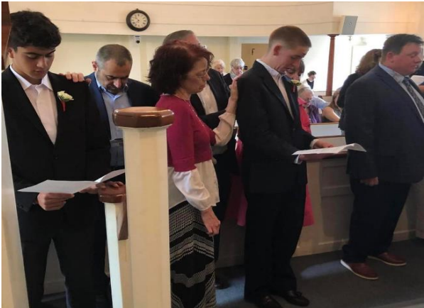
Parents and mentors were so proud & supportive