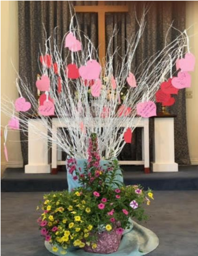
"Give a Little Love Away"