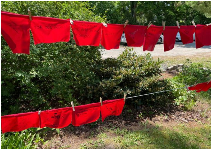
A beautiful day for the first outdoor service of the season as we hung our prayers for the church and the world