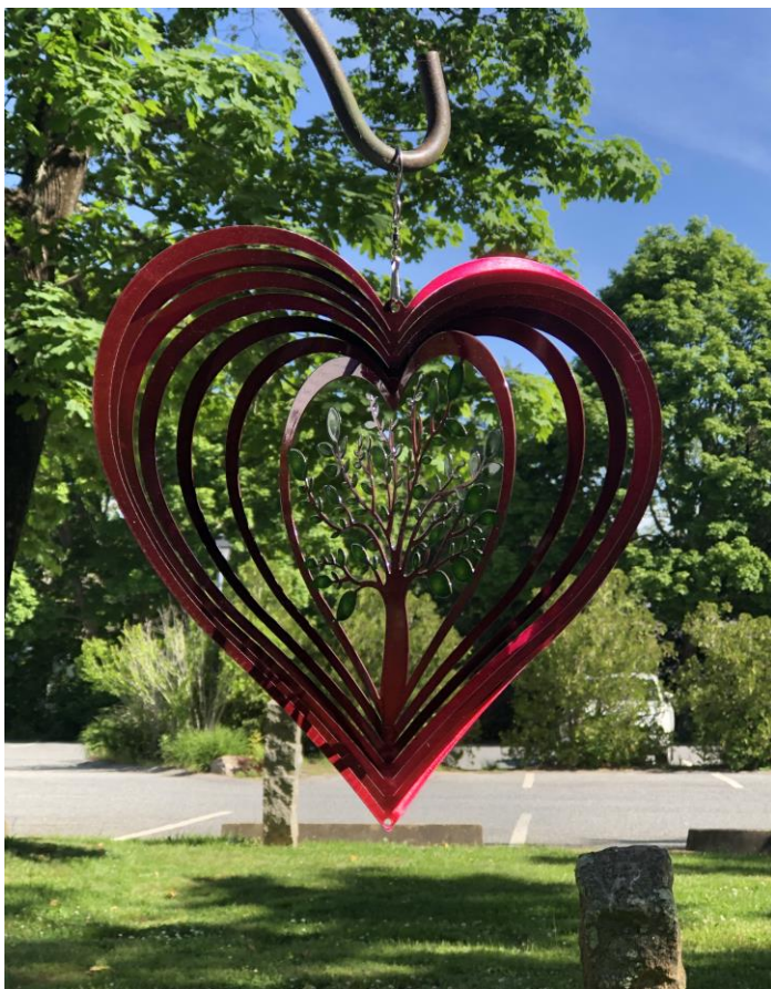
Wind of the Spirit.