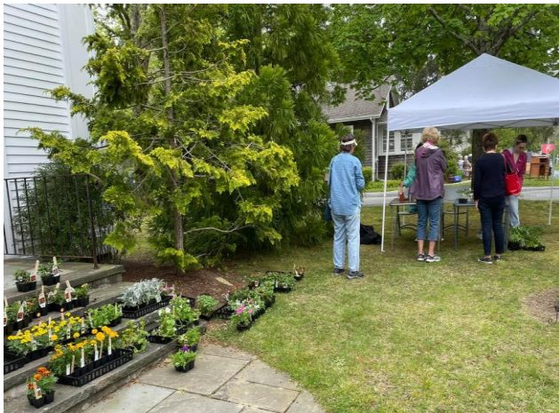
A variety of beautiful plants to choose from.