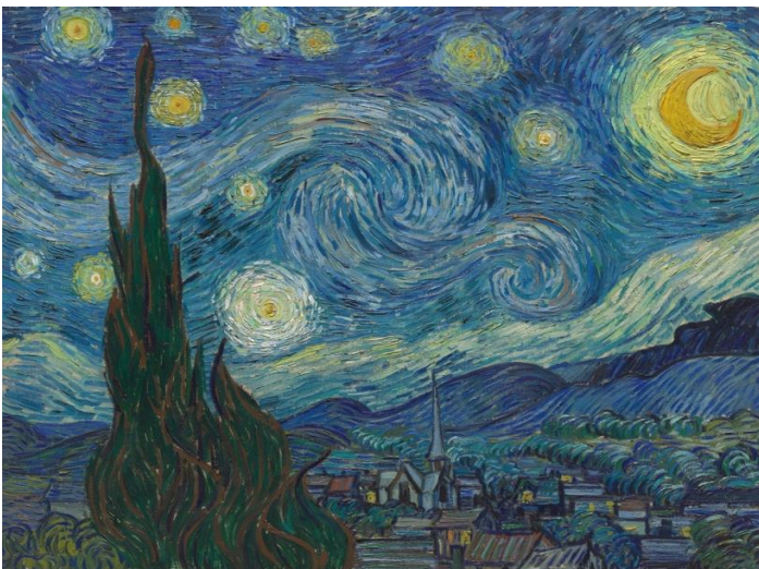
"Starry Night" Vincent Van Gogh

Resource: Salt Project. Vincent Van Gogh and the Beauty of Lent—A Lenten Devotional . Saltproject.org 18.