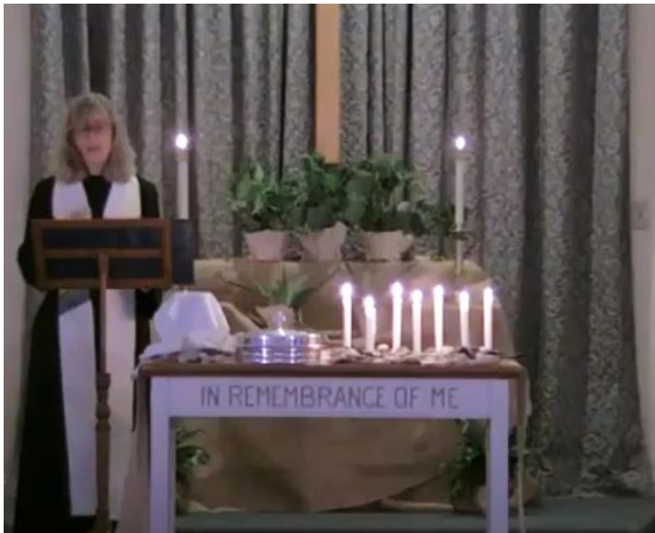
“The Seven Last Actions”