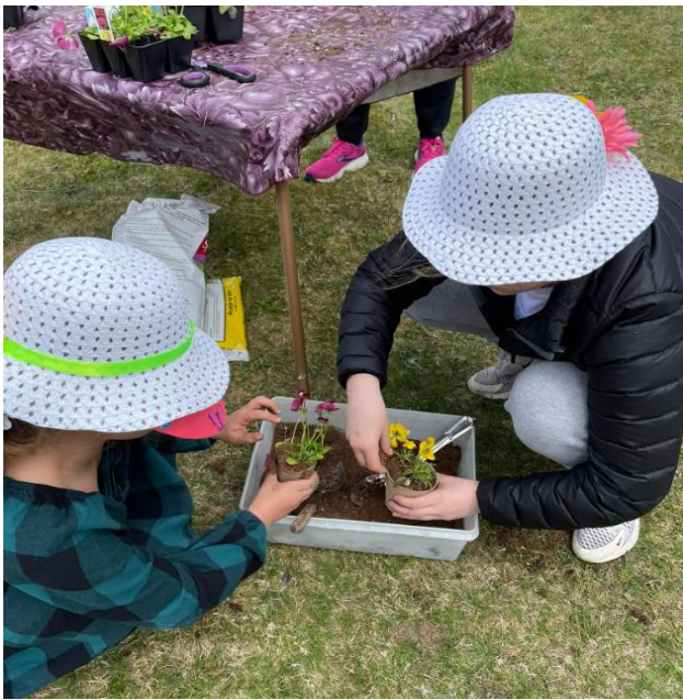
Pansies were planted and hats decorated to take home.