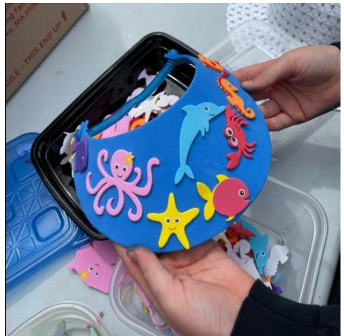
Fun Easter Hats were made!