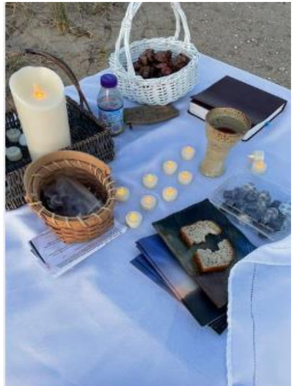
The Sunrise Service 5:45 a.m. with both a full moon and sunrise.