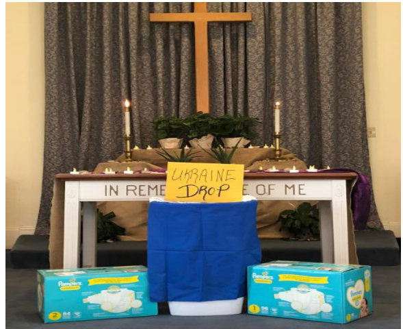
Other opportunities for helping Ukrainians are still being held.

THANK YOU!! The response to the list of needs for helping the displaced Ukrainians was amazing!