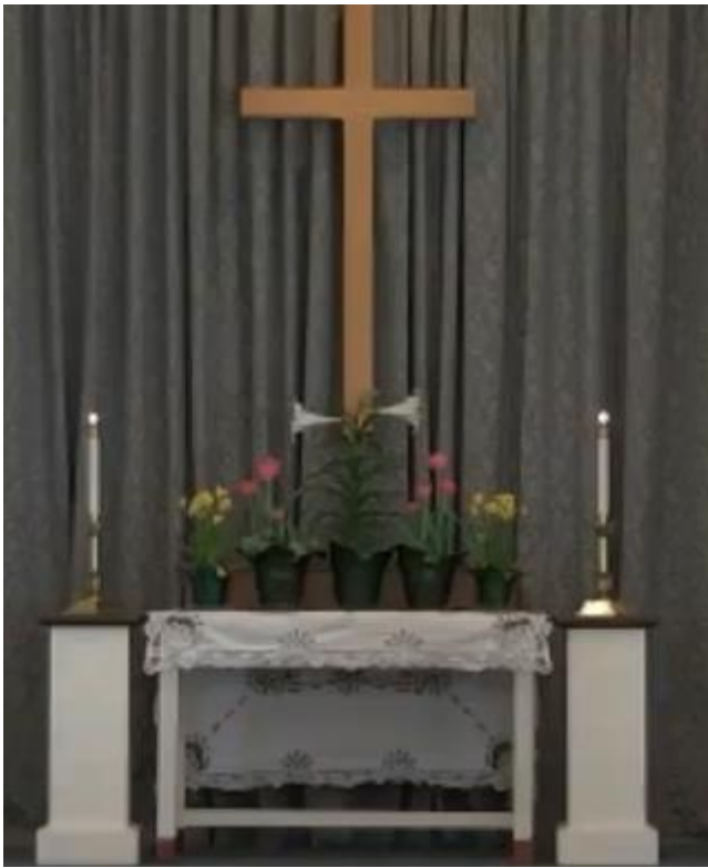
The 10 a.m. service the lovely altar plants and the flowering of the cross.

Saturday, April 16 th "Celebrate Spring"