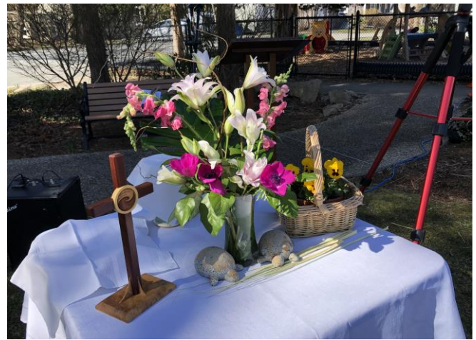
Signs of Spring