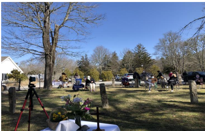
A beautiful day, OUTSIDE AT LAST!!!

https://www.youtube.com/watch?v=UxShmclwhl8