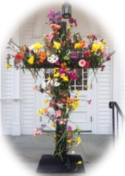
Easter Sunday, Dance for Joy: He Has Risen!