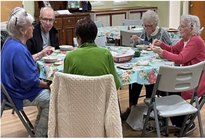
Thursday Winter Soup: a time of connection and conversation