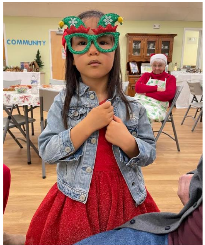
The fashionable & festive Bella