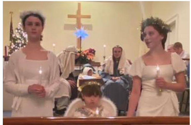
Joy to the World!