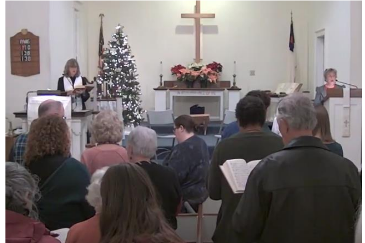
A full sanctuary for the combined Pageant & Candlelight service.