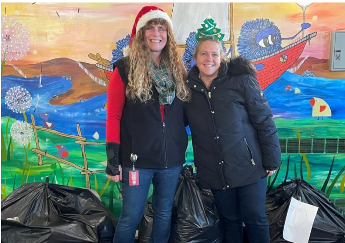
Full Christmas stockings for the women living in the BTEO house.