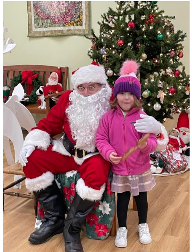
December 7 th , Santa arrives at NFCC