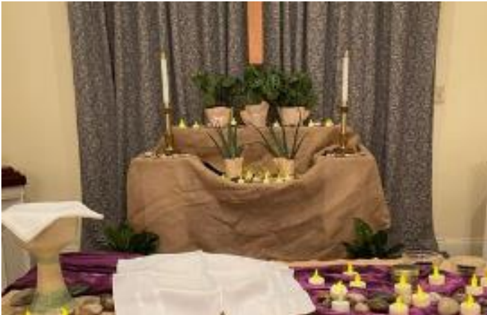
The season of Lent began with a moving service.