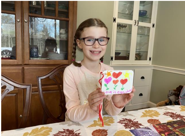
A Great Brother and Sister Team!!

In February, we collected white socks to support the outreach of the Duffy Health Center, Here and Now Outside Ministries and Belonging to Each Other. All are ministries that support the marginal and homeless here on Cape Cod. (Over 200 pairs were collected). Multigenerational volunteers made valentine tags to place on the BTEO items as well as the food distributed by Meals on Wheels.