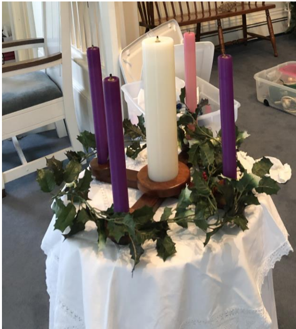
The finished advent wreath