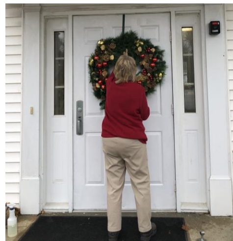
And placing the wreath on the side door