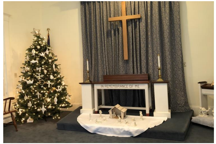
The finished tree with the Crèche

CHRISMONS..... Again this year, the Altar Committee has decorated the sanctuary for Advent and the Christmas season. The white and gold ornaments on the tree and the wreath are called Chrismons. They were handmade by the ladies of our church back in the 1980's. The original Chrismons were developed in 1957 at a Lutheran church in Virginia as a decoration appropriate for the church Christmas tree as opposed to the colored lights and secular symbols being used at that time. The Chrismons are Christian symbols made in white with gold decorations. "Chrismons cannot be bought or sold; they can only be made to give in love and in celebration of Christ's birth." The NFCC is truly fortunate to have these beautiful symbols of the true Christmas decorating our sanctuary.