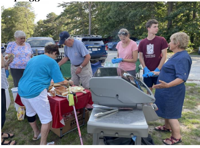
July 7<sup>th</sup> North Falmouth Village Unplugged