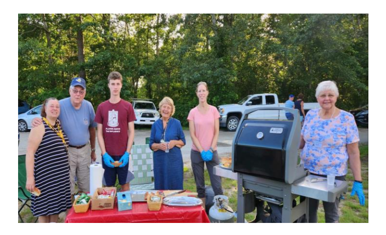
NFCC outreach volunteers cooked around 200 hot dogs for the attendees.