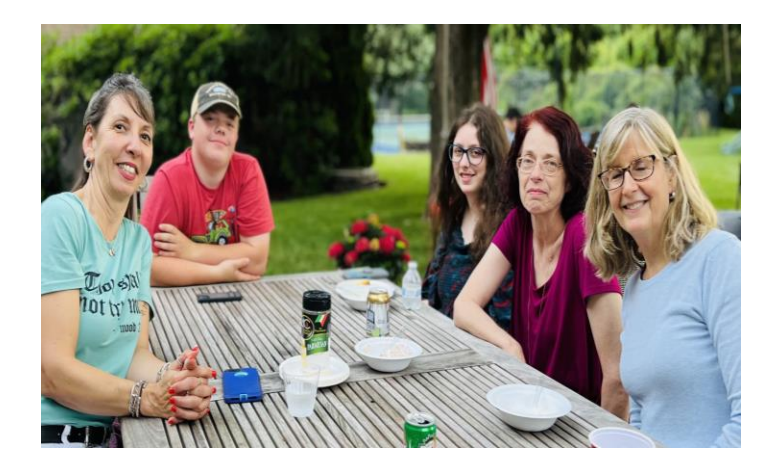
Good food and a lot of catching up to do!